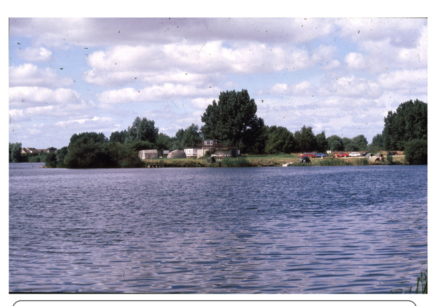
The popular and prolific Horseshoe Lake became the focus of Society dreams as the 1990s startetd

The increased workload of the Redmire bookings – handled by Vic Cranfield through the Society office – on top of the admistration of a growing membership, plus running the