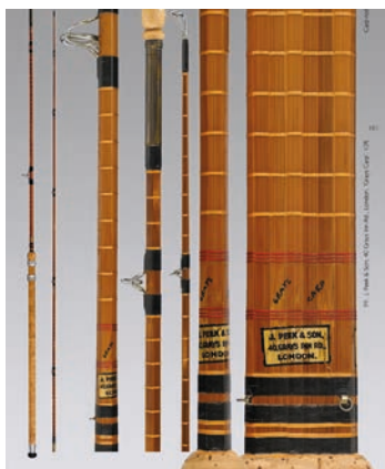
The book is illustrated by in excess of 184 pages of A4 highest quality photography showing this kind of detail from David Petty's impressive cane rod collection.

'Every so often a mind-blowing study of vintage tackle is